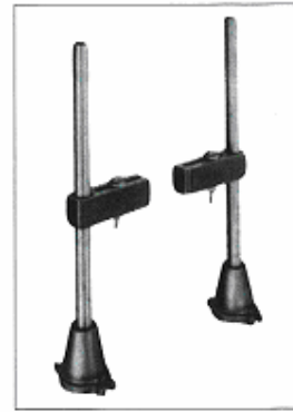
Guide Rods & Bushed Arms