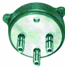
Fixed Position Plate

The maximum angularity of universal joint assemblies should be no more than 22 degrees to obtain best service life.